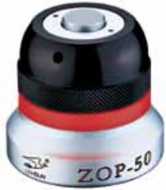
Electronic Tool Length Setter